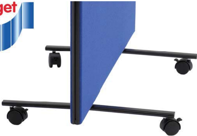
Set of Castor Feet from £17.50 Suitable for use with Morton & Budget screens Makes the screen more mobile for easy transportation