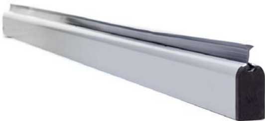
Wall Linking Battens from £22 Only suitable for use with flat walls. Suitable for use with Morton & Budget screens