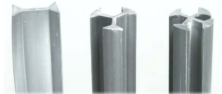
Linking Strips from £4 2, 3 or 4 way available Suitable for use with Morton, Budget & Flexi-screens