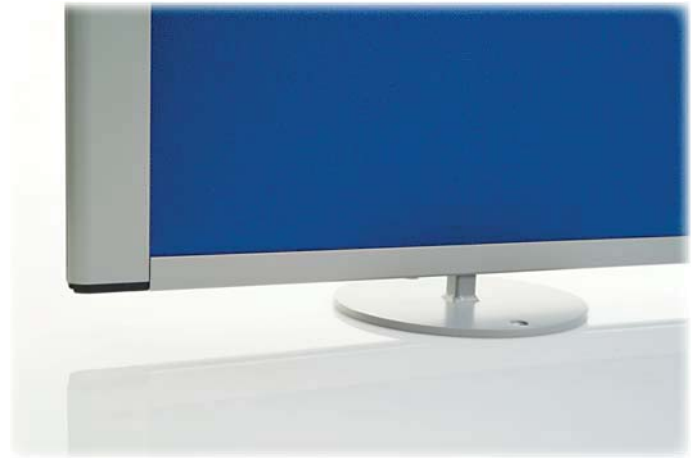
Set of Round Feet from £23 Available in silver black or grey Suitable for use with Morton & Budget screens