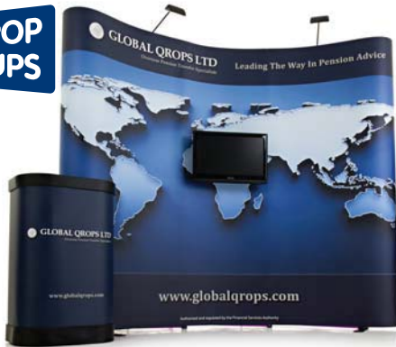
Monitor Stand from £89 Monitor fitting takes VSA 100mm, 75mm & 50mm centres