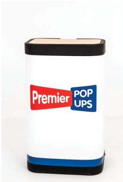
Premier Upgrade Kit from £80 Includes graphic wrap & beech top for wheel case & lights