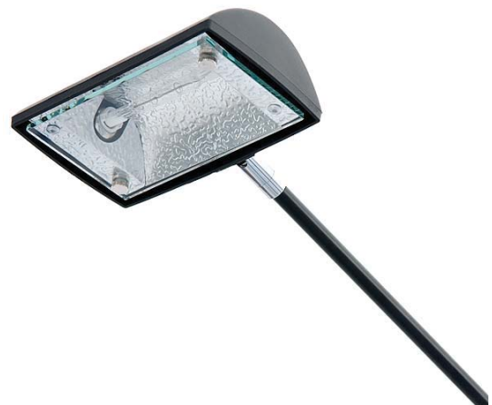
Pop Up Floodlight from £23 Pop up Stand flood light, 200 watt mains halogen light, 3 metre lead & pop up stand fitting.