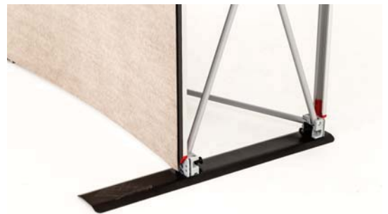
Pop Up Stabilising Feet from £18.50 Adds extra stability to the Pop Up