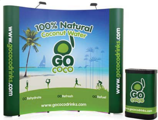
Replacement Panels from £64 Various prices depending on size and requirement