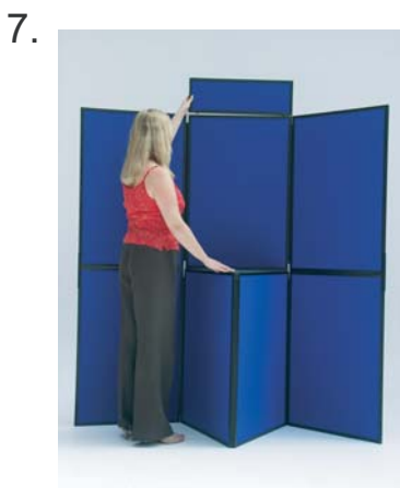
Add a header panel by inserting the header into the top frame and securing with the fixing channel