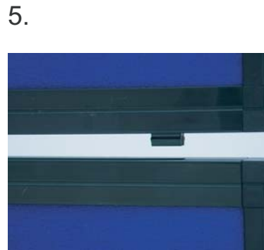
Slot the panels together by locking the top panel into the bottom panel