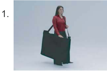
The CarryLight Display Boards are supplied with a black fabric carry bag for easy transportation