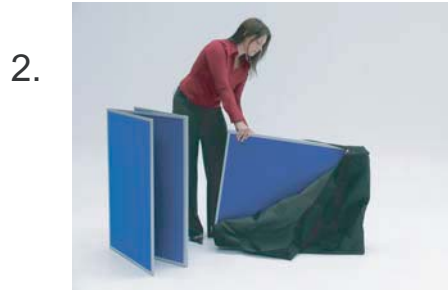
Remove top and bottom panels from the fabric carrying bag