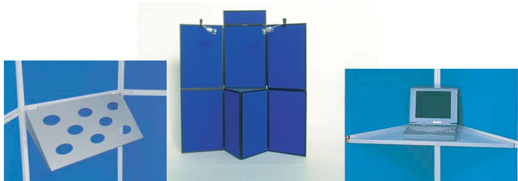
Sloping leaflet shelf