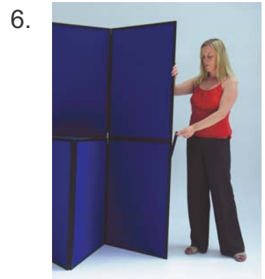
Slide the fixing channel over each end frame, to secure into place